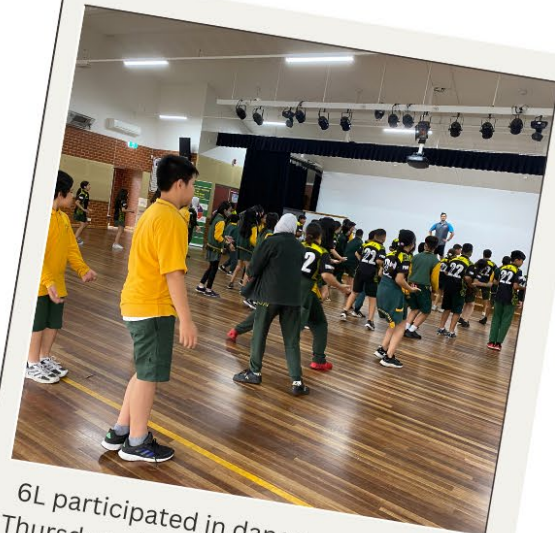
6L participated in dance every second Thursday of the week. They also learnt a dance during middle schooling.

It has been one hectic term for 6L. We have been preparing ourselves for high school and all of the end of year events. Take a look at all the exciting things we took part in this term.