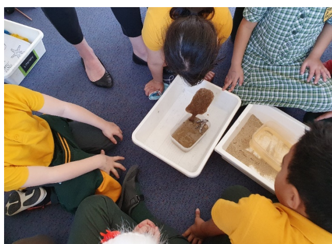
Students using sand and water to make a beach