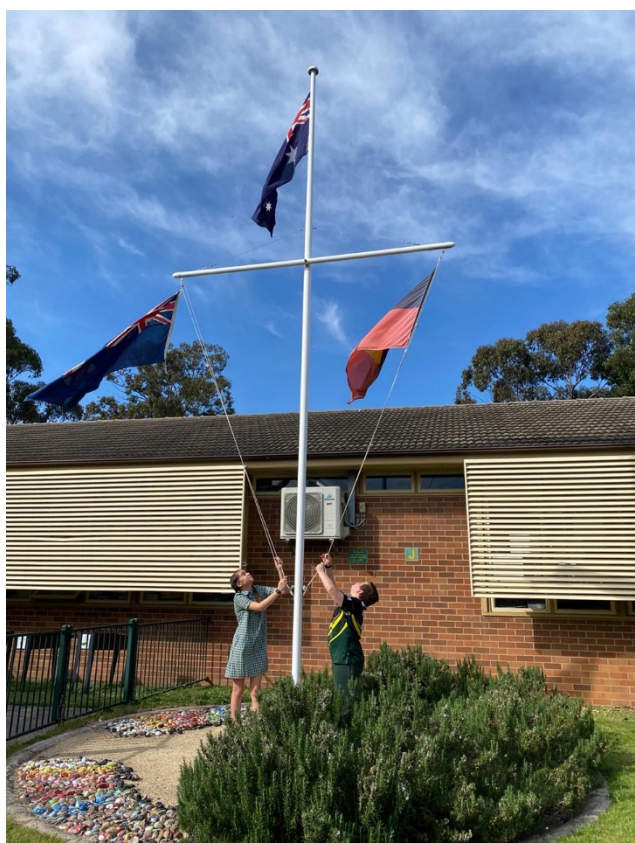
Citizenship day- full flag mast

As you can see by the following photographs, students were engaged in a variety of exciting learning experiences during term 3.