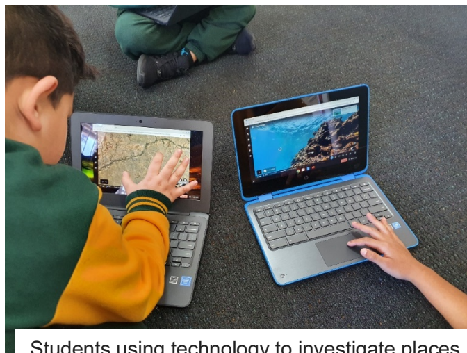
Students using technology to investigate places around the world.