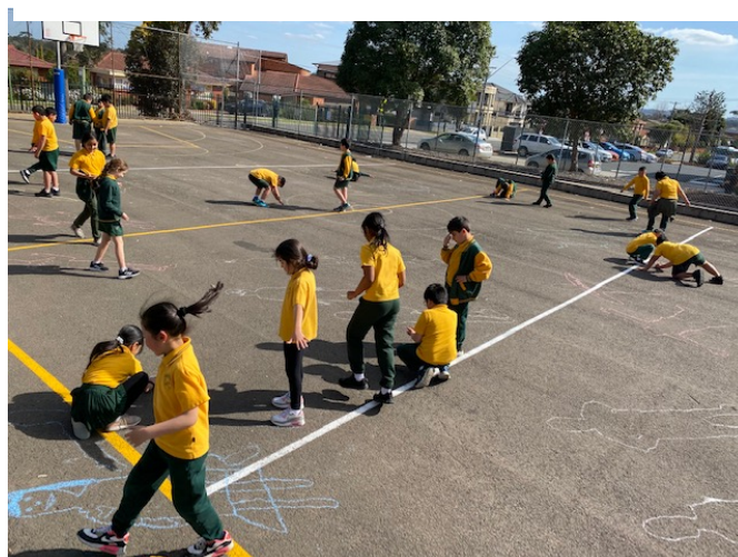
Students discovering shadows in science