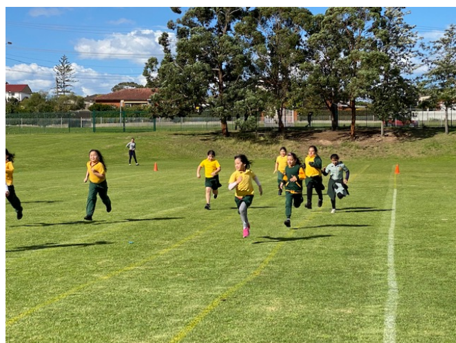
COVID safe athletics carnival races