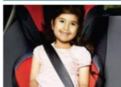
4+ years Approved forward- facing child car seat or booster seat