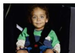
6 months to 4 years Approved rear- or forward-facing child car seat