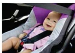
Up to 6 months Approved rear-facing child car seat