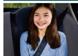
145cm or taller Suggested minimum height to use adult lap- sash seatbelt